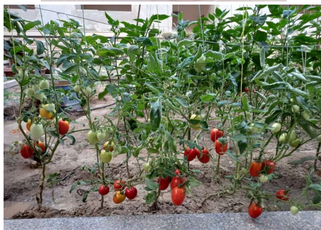
Photo -11. Grown tomato crop.