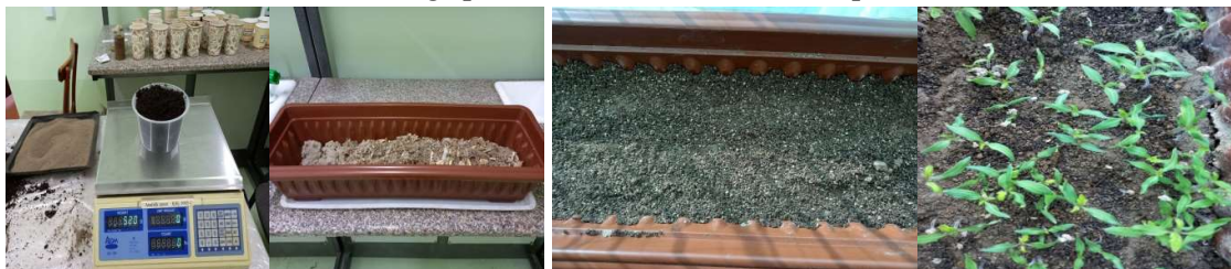
Photo 10 - tomato seedlings planted and cared for in the open field "Control".

Photo 9- tomato seedlings planted and cared for in the open field "Experiment".