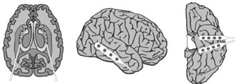
Figure 1 Implanted electrodes in the brain

Temporal lobe epilepsy with the epileptogenic foci in hippocampal formations was diagnosed. Figure 1[23] depicts a schematic of how intracranial electrodes are to be placed. They implanted both depth electrodes and strip electrodes symmetrically into the hippocampal formations, which are located in the neocortex's anterior and posterior regions. All of the recording sites that showed ictal activity were used to select the EEG segments. A total of 300 EEG data segments were generated by treating each EEG segment as an unique EEG signal.